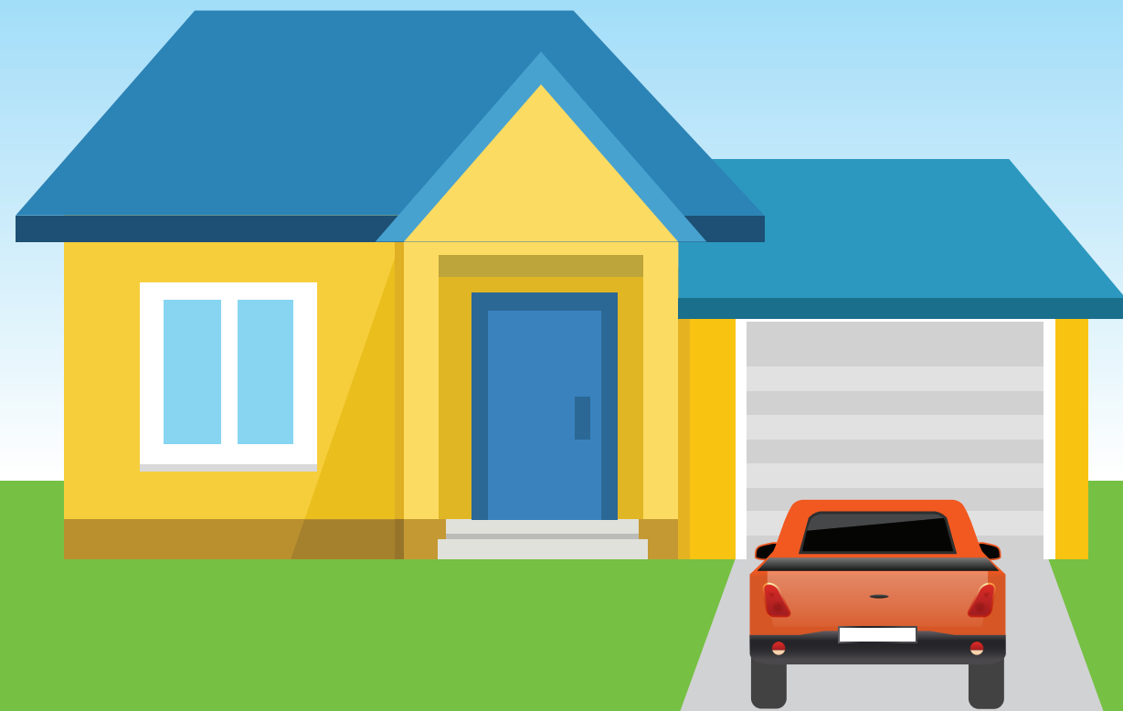
1 off-street parking