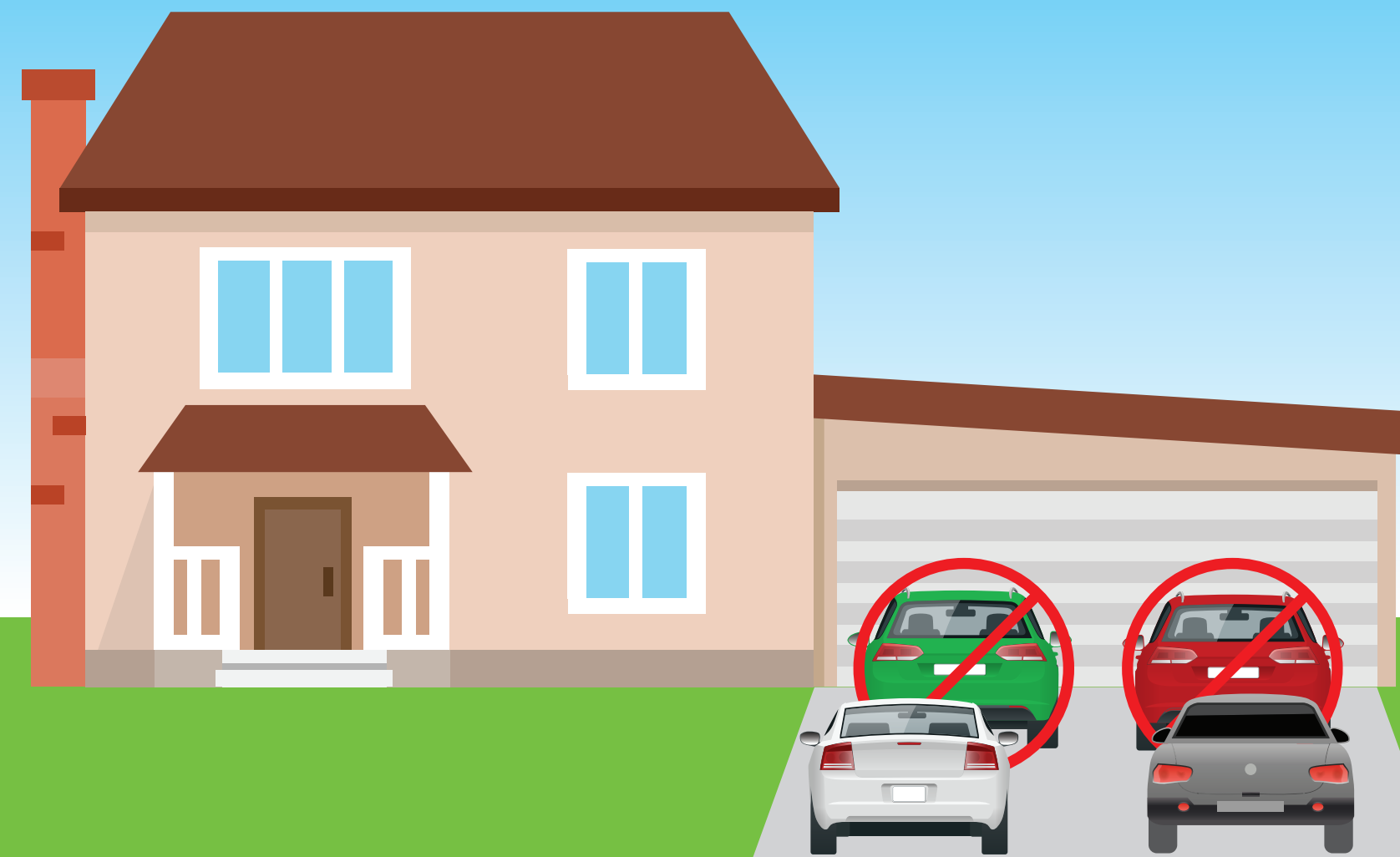
2 off-street parking