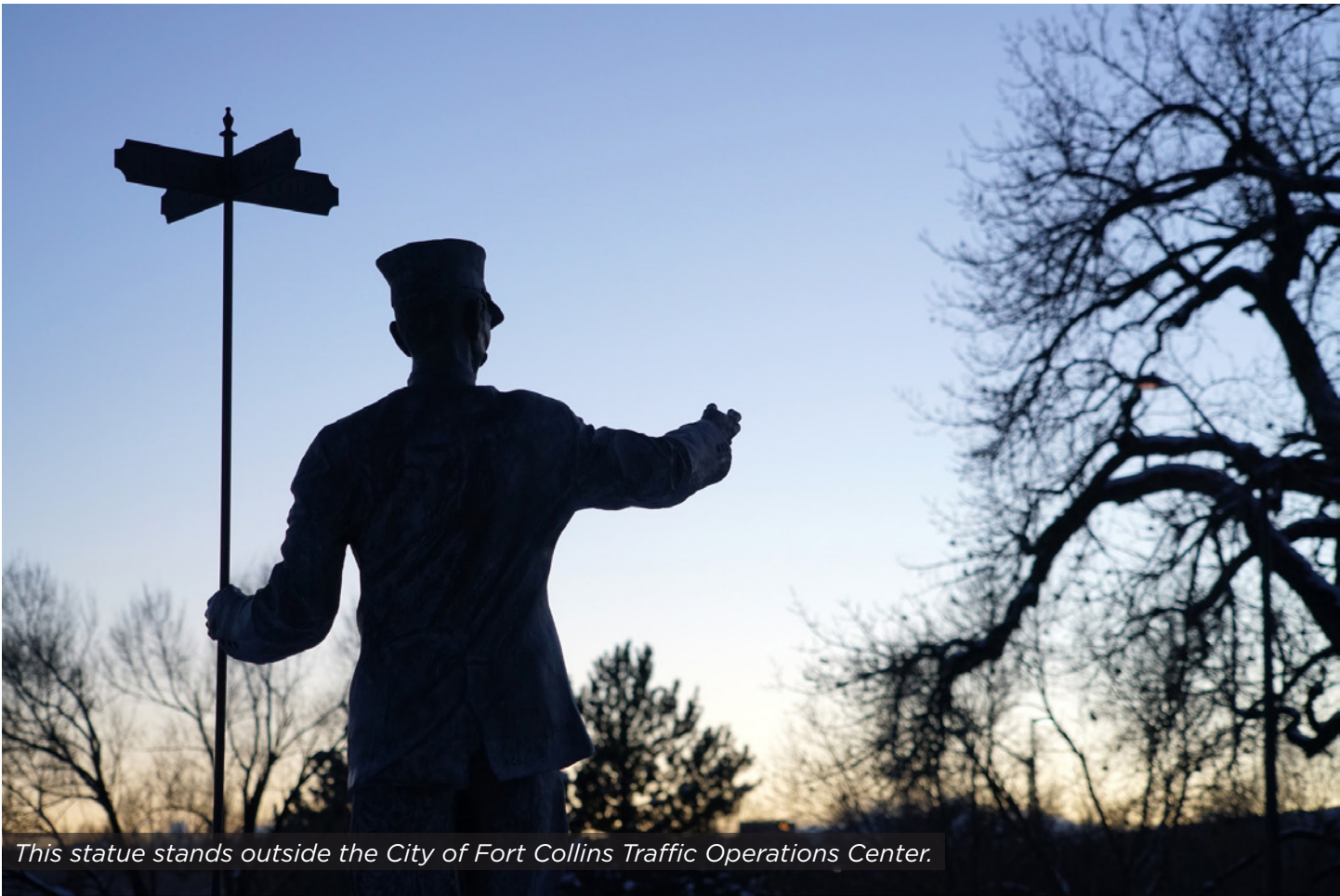
This statue stands outside the City of Fort Collins Traffic Operations Center.