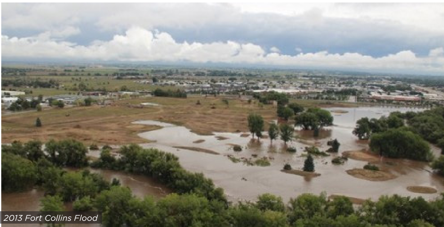
2013 Fort Collins Flood

For example, if a severe storm is forecasted and data shows the storm is likely to result in road closures and other travel disruptions, the City can take preemptive measures. This could include free transit rides or coordinating with local employers to institute flexible work arrangements to keep people off the roads during the event. Using a data-driven approach to understand how a shifting climate impacts transportation will enable Fort Collins to have a resilient transportation network.