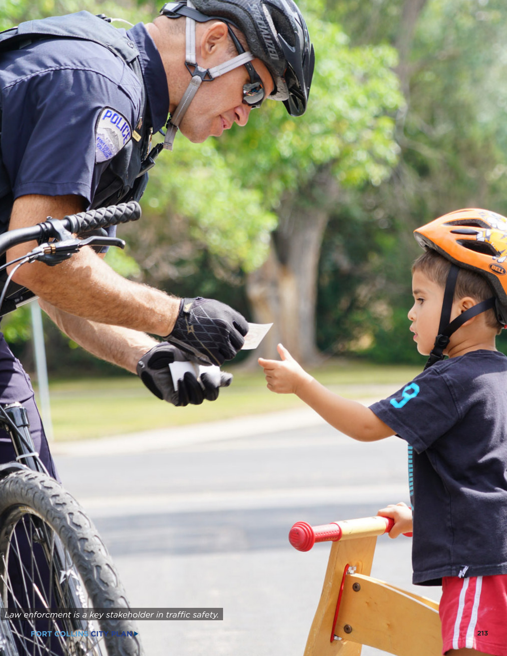
Law enforcement is a key stakeholder in traffic safety.