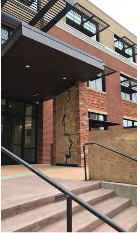
The Water We Share 222 Laporte Ave 2016

The Water We Share is the two-story column adjacent to main entrance. This artwork highlights the Cache la Poudre River watershed. A series of Colorado buff sandstone panels are split vertically by the path and topography of the river. The imagery represents a section of the Cache la Poudre just to the west of town. On the western face, carvings trace the journey of water from snow melt to runoff and river. On the eastern face, patterns of land use speak to the human uses of water. At night, the thread of the river is illuminated by LED lighting.