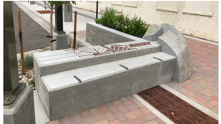
Conveyance Willow Street between Linden and Northside Azlan Community Center 2019

The Willow streetscape takes the form of three waysides that explore the ways that Cache la Poudre River water is conveyed from the mountain top into the lives of the citizens of Fort Collins. Visitors explore the nature of the river through a series of three interactive stops illustrating a canyon, a mill race, and pipes. A haiku accompanies each wayside to illuminate the unseen and sometimes underappreciated miracle of water in our lives.