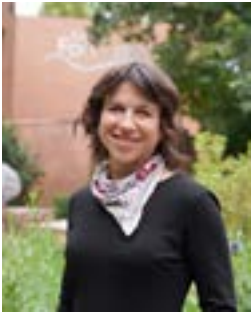
Emily Francis (Mayor Pro Tem) Councilmember, District 6