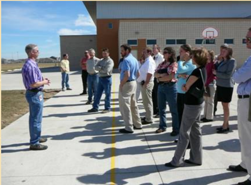
Partner Talk and Tour