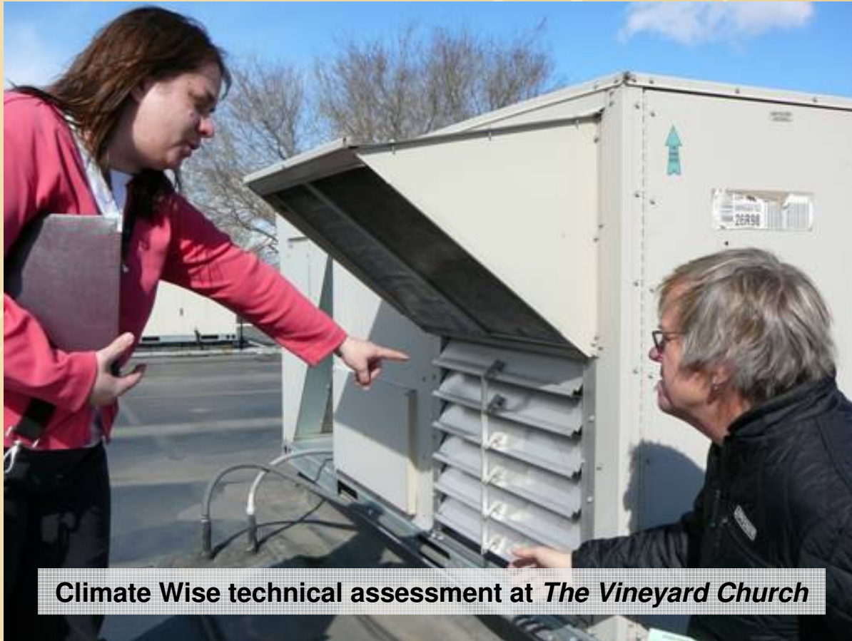
Climate Wise technical assessment at The Vineyard Church