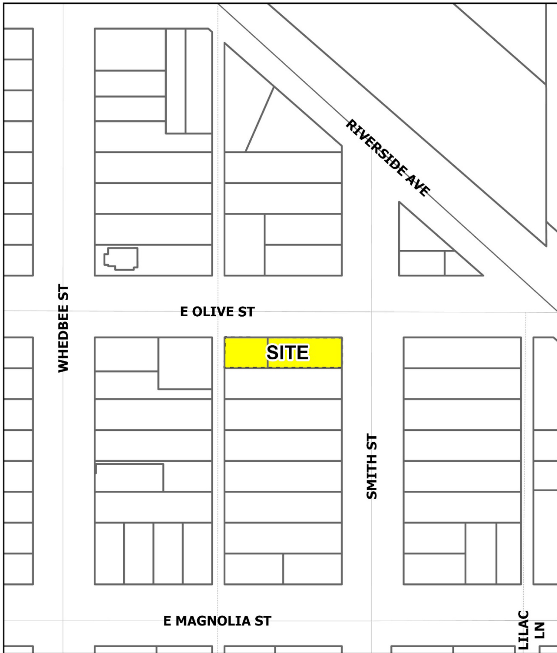
Braisted/Olson Subdivision – BDR240011 LOCATION MAP