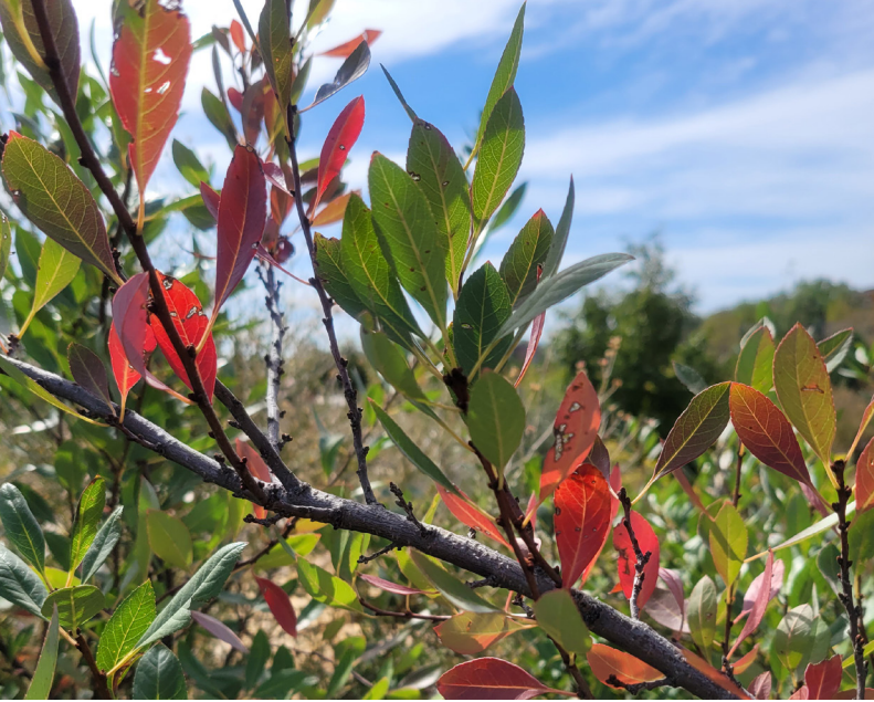
Prunus pumila var. besseyi

after forest fires. The trees light these slopes ablaze in fall, when they color in shades of gold, orange, and near-red. Q. gambelii have alternate, deeply lobed leaves (compared to other native Quercus ) that are two to four inches long, have a brown-gray bark, and produce long acorns that caps cover one third or more of the nut in the late summer early fall. A good example of Q. gambelii can be found right before you enter the Foothills Garden in the sedum slope closest to the stage.