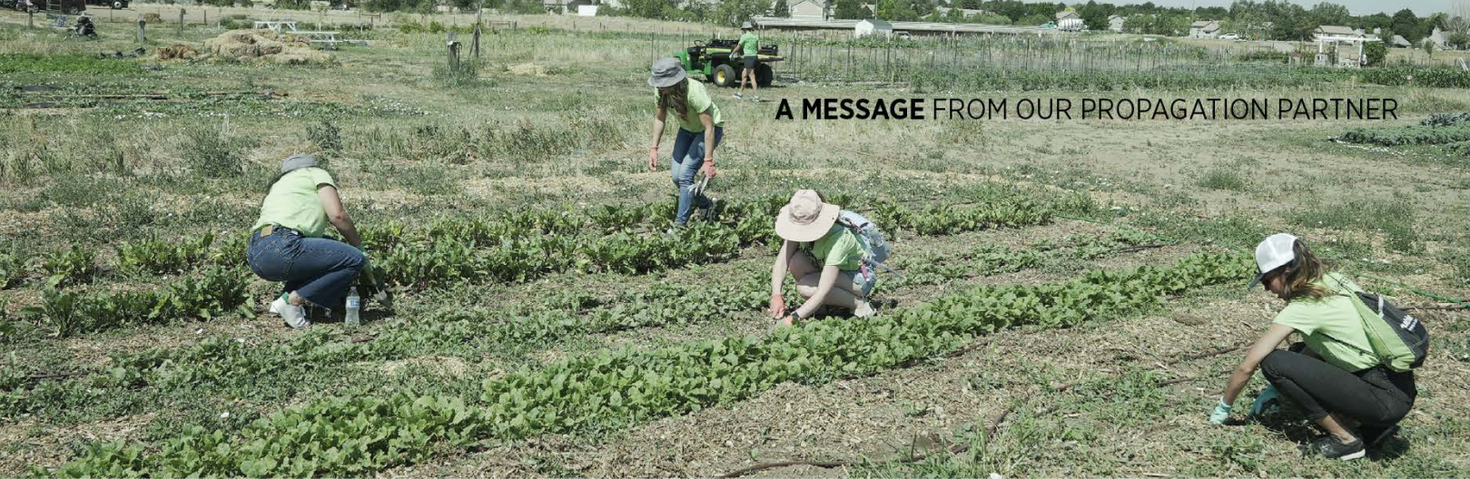
A MESSAGE FROM OUR PROPAGATION PARTNER