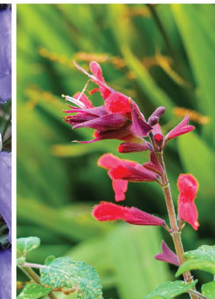
Salvia elegans, Pineapple Sage