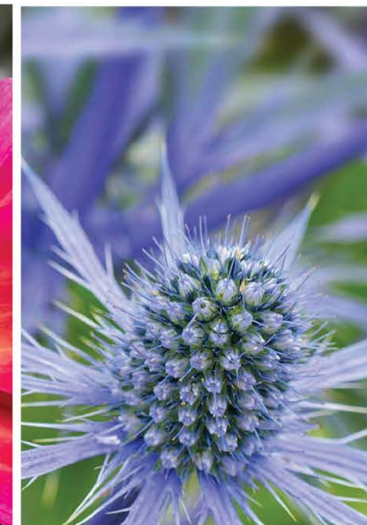
Eryngium 'Blaukappe' Blue Cap Sea Holly