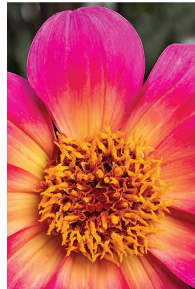
Dahlia Happy Days™ 'Fuchsia Halo'

An underutilized annual herb that deserves more attention in gardens, Monarda citridora, lemon bee balm , has a distinct lemon flavor that is wonderful in teas, cooked foods, and salads. The flowers are whorls of light pink petals that fully circle around the stem of the plant, coming through light green foliage. Flowers last for weeks on end making it perfect for pollinators. Plants grow in large clumps making it perfect for herb gardens or perennial borders. Lemon bee balm is an annual but will re-seed freely and will come back year after year.