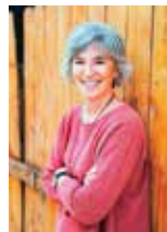
Friends of The Gardens Board President

We've had a wonderful first half of 2023 and we look forward to seeing you this summer. Thank you for being a Member!