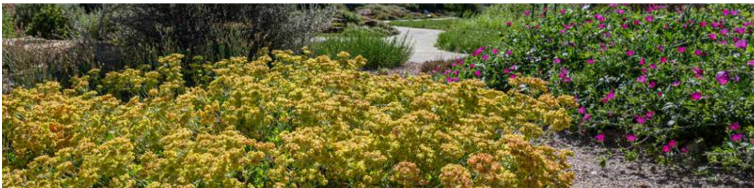
KANNAH CREEK® buckwheat has masses of yellow flowers that turn orange as they age.