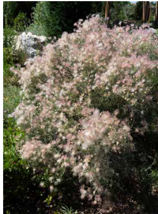
Apache plume is a glorious native shrub with pale pink to white blossoms and feathery seedheads.