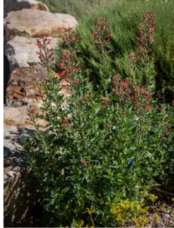
Red birds in a tree is a hummingbird's delight.

If you’re looking for plant inspiration, The Gardens is a wonderful showcase of Plant Select. You can find the plants woven throughout the site—from the Plant Select Garden, to Lauren Springer’s Undaunted Garden, to the Children’s Garden. Just look for the Plant Select logo on the plant tag.