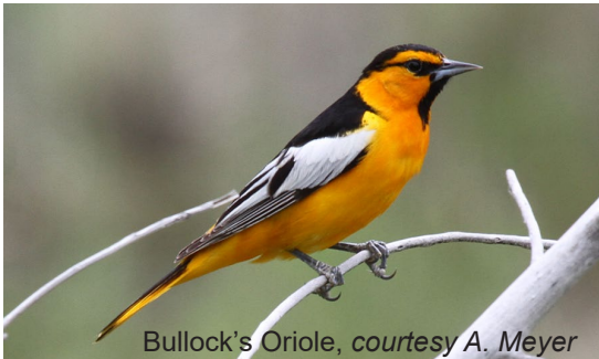
Bullock's Oriole