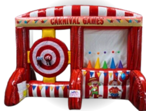
Axe Throw, Archery, or Nerf Target from Dizzy Party Rentals