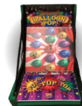
Balloon Pop from Dizzy Party Rentals