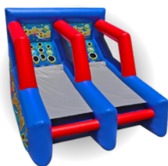
Roller Ball from Big Air Jumpers