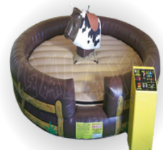
Mechanical Bull from Big Air Jumpers