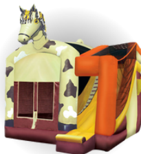
Prancing Pony 4 in 1 Combo from Big Air Jumpers