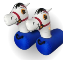
Inflatable Ponies from Best Event Rentals