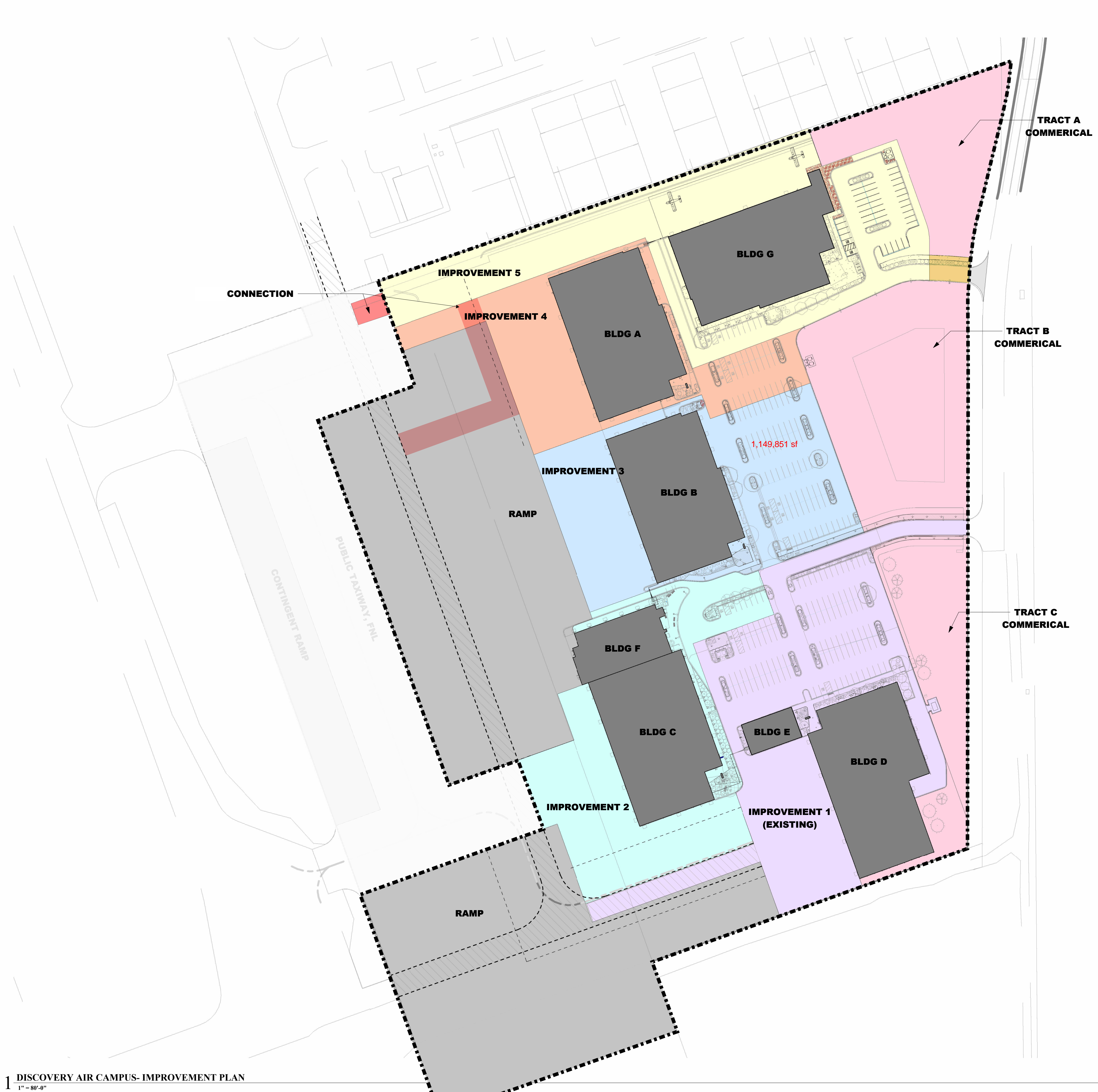
EXHIBIT B TO ORDINANCE NO. 149, 2024