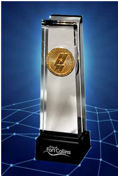
Malcolm Baldrige National Quality Award Recipient 2017