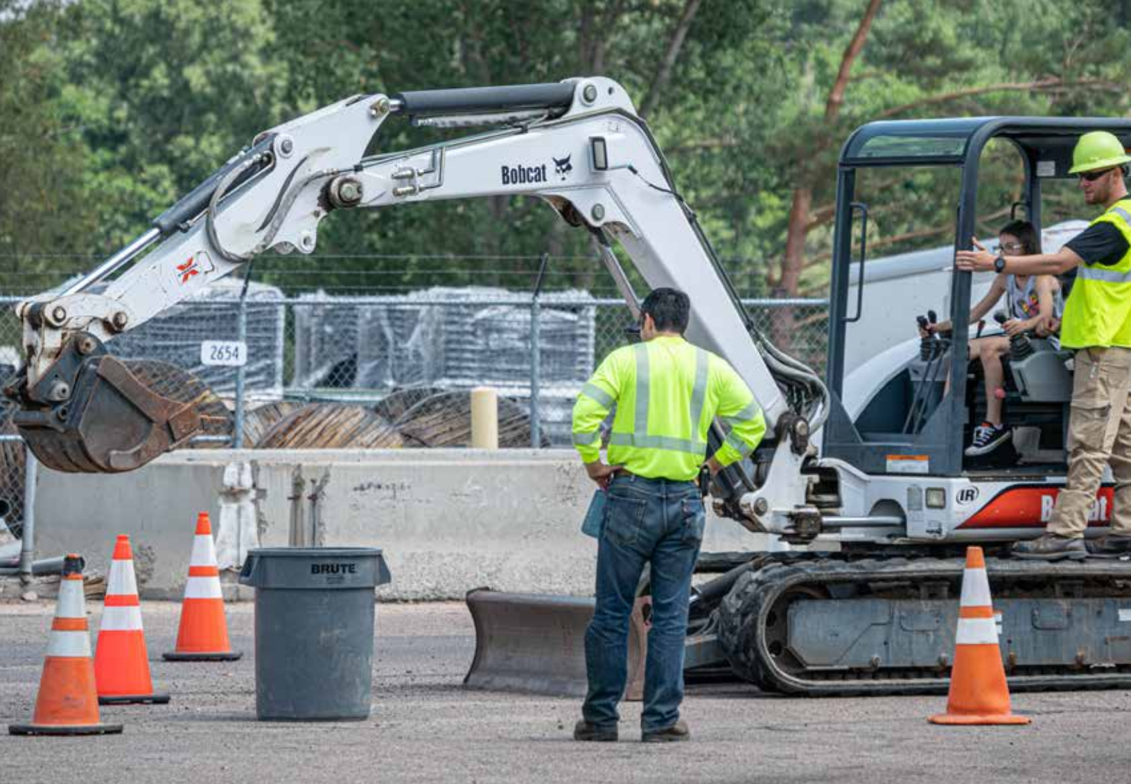
Photo: Fort Collins Bring Your Child To Work Day 2021. Utilities employees show children how to pick up a basketball with the front loader.