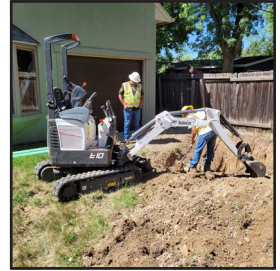
Crews removed an old brick sewer manhole